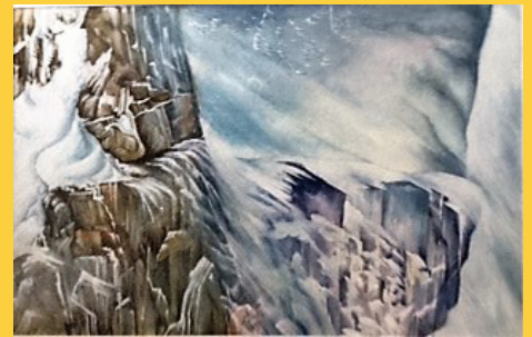
Snow Storm watercolor Teresa Prashad