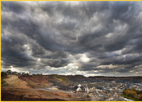
Angry Sky