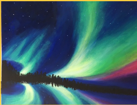
Northern Lights acrylic Shahina Siddiqi