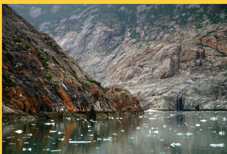
Endicott Arm Fjord, Alaska