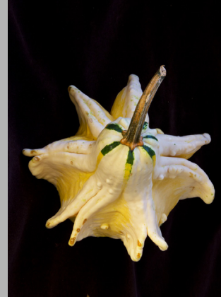
White and Yellow Gourd