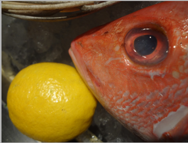
Still Life with Fiish and Lemon