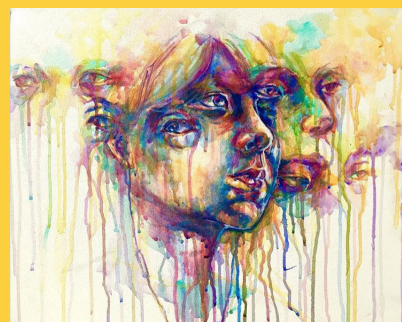
Untitled, by Rachel Tang