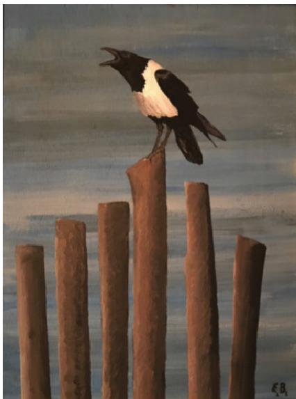
The African Crow latex Ed. Belding

Botany & Zoology at The Gallery through May 19, 2017