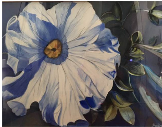
Blooming in Blue oil, Shahina Siddiqi