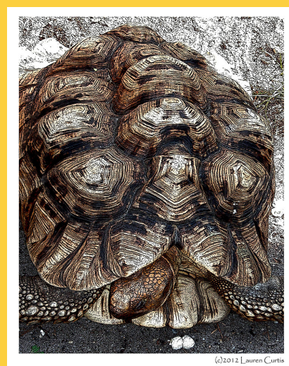
Tortoise photography Lauren Curtis