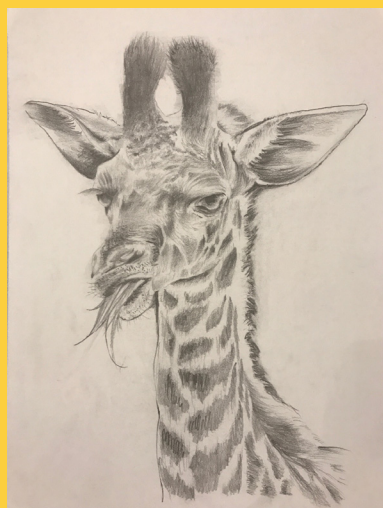
Giraffe graphite Lakshmi Durga