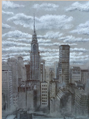
NYC Skyline pencil, Carl Frankel