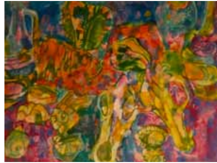
Don Bloom East Brunswick

Metuchen 732.549.2895 • joan_arbeiter@hotmail.com Meadow II acrylic & oil pastel: 14h x 25w