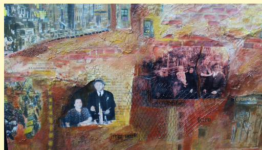
Remembered , collage by Carole Grand

Local Galleries, Theater Performances, Concerts and More