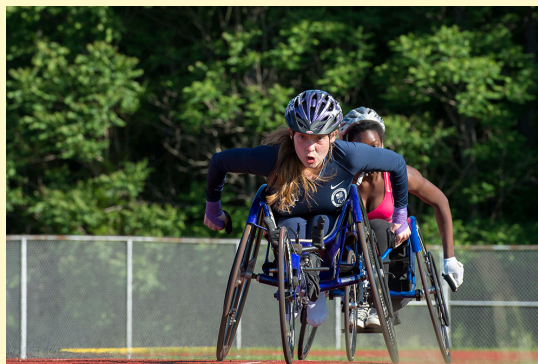
Speed , photograph by Joan Wheeler