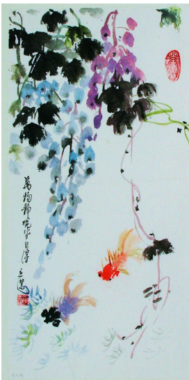
Goldfish with Wisteria, watercolor, Joanne Yang

For this exhibit we asked for work that incorporated one or more of the elements of rhythm, texture and color in a significant way, whether through a realistic or an abstract image; for example, art effectively employing repetition and variation or the subtlety or passion of the palette or where the viewer wants to reach out and touch the richness of the surface. Juror Eva Mantell of Princeton selected 35 works representing 22 artists for display.