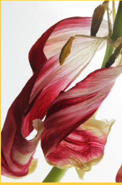
Tulip, a Memory