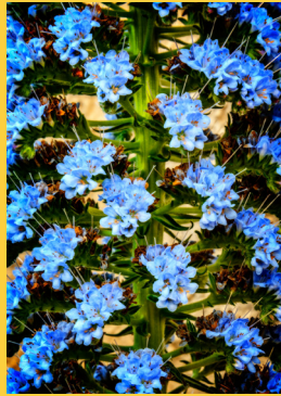
The Blues