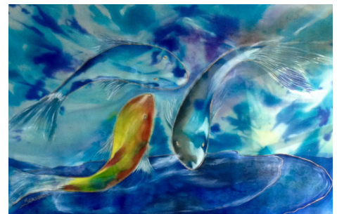
Water Dance silk dyes on silk, Teresa Prashad

SBHS Student Invitational January 20 to March 3, 2017 Works by SBHS art students selected by their teachers.