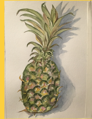
Pineapple watercolor Andrea Orlando