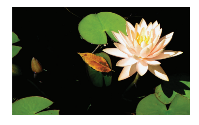
Ann Sisko Somerset asisko@ comcast.net Lotus and Leaf photography 16h x 20w