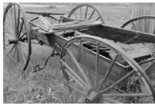
Colorado Wagon, photography, Rhonda Goodwin