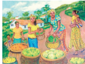
African Harvest, acrylic, Rosalind Orland