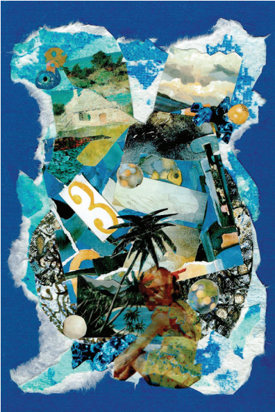
The Island , collage, by Nancy Scott. On display at the South Brunswick Municipal Building through September 30.

If you are interested in helping to determine the future of the South Brunswick Camera Club, please contact Jim Pickell, dotjimp@aol.com, 732.821.6196