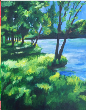
Sanctuary Laurie Budhu